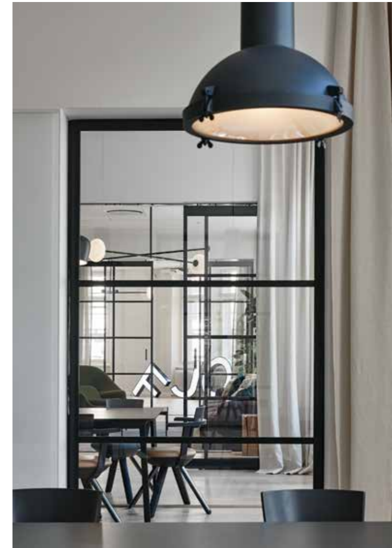
04_Fjord Helsinki, 2017. Office and studio interiors for creative agency Fjord Helsinki.