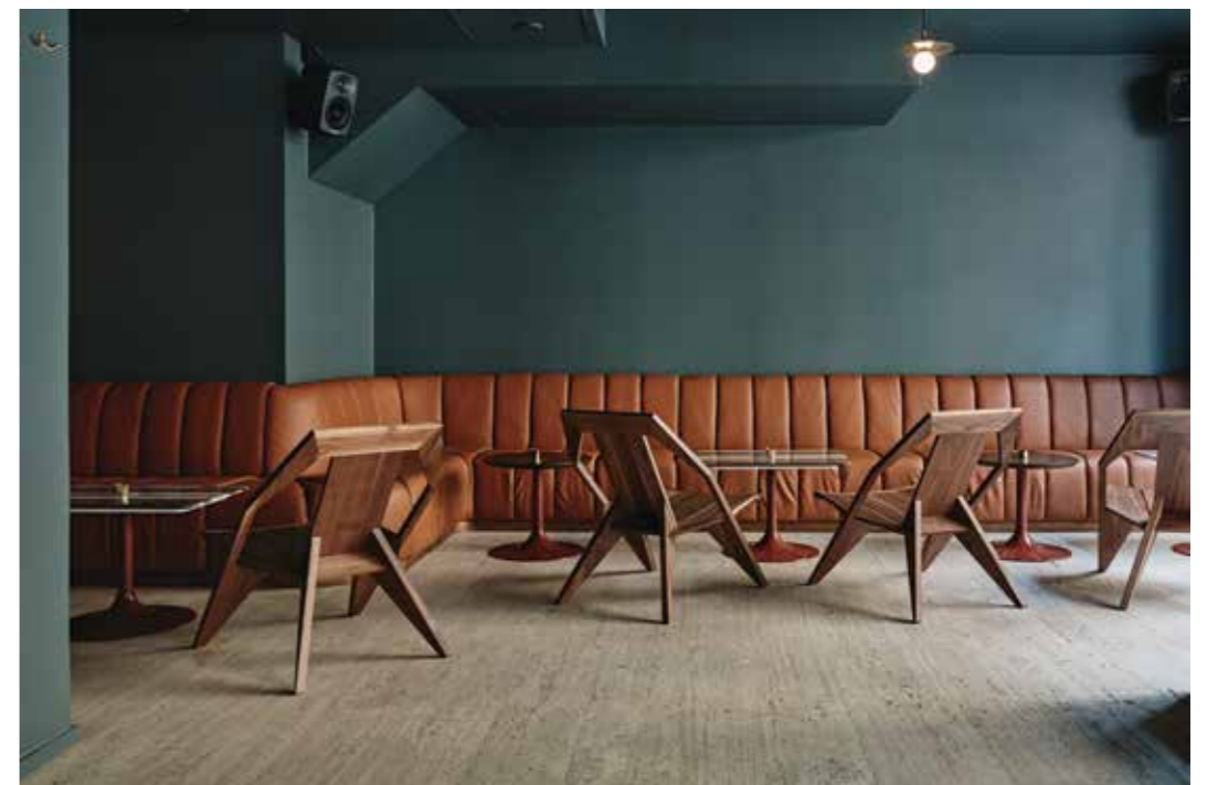
02_Jackie, 2017. Bar interior and furniture design for Straight No Chaser Oy.