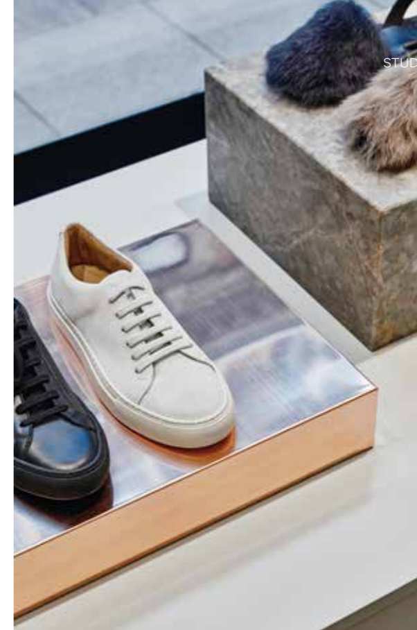
03_MI.NO, 2017. Retail and interior design for MI.NO, a small show boutique for women's shoes and accessories.

“We believe that a well-designed project is the best form of sustainability. Our designs are always crafted from the end-user’s point of view.”