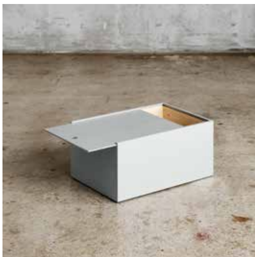
01_Lundia System, 2014.

Shelving system with box sizes measured by paper size standards for Lundia Oy.